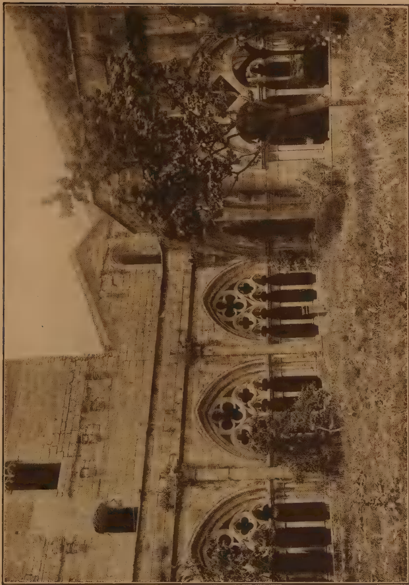
A MONASTERY COURT